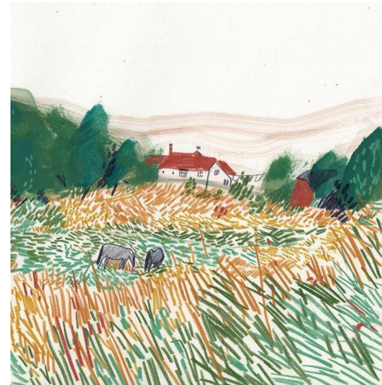
Charlotte Ager Horses This Time (2019)