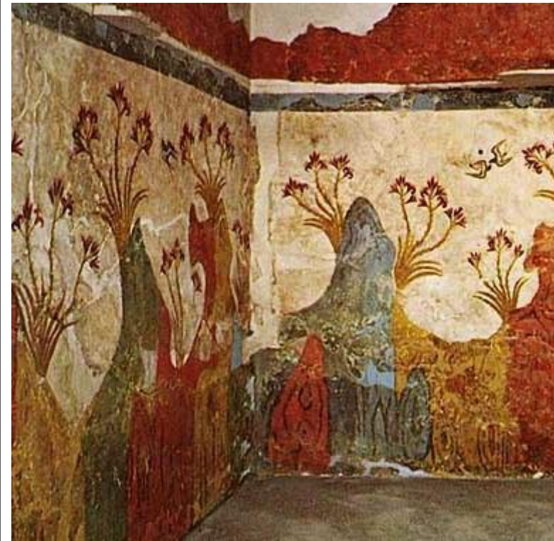
The Spring Fresco, from Akrotiri, Thera (Santorini), Minoan Civilization, 16th Century BC

Landscape is one of the principal types or genres of subject in Western art