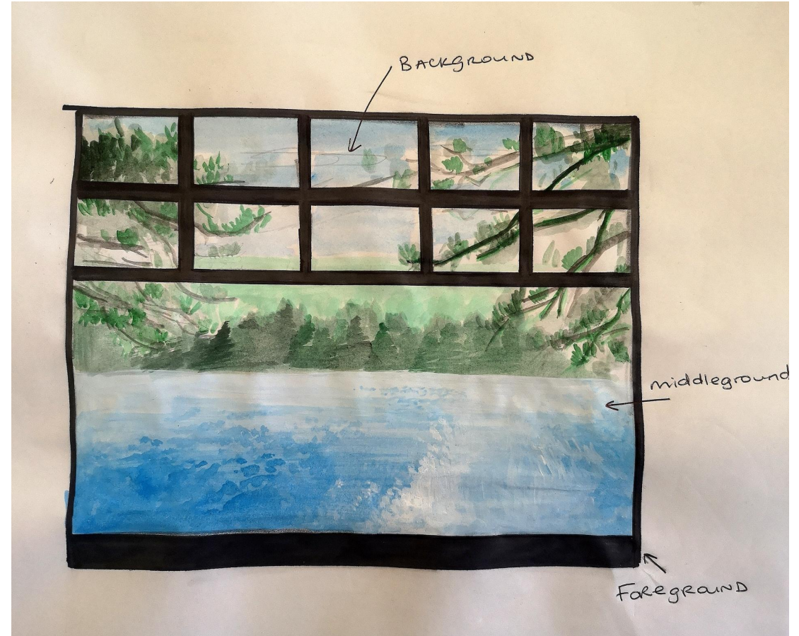
Design drawing, identify the foreground, middleground and background