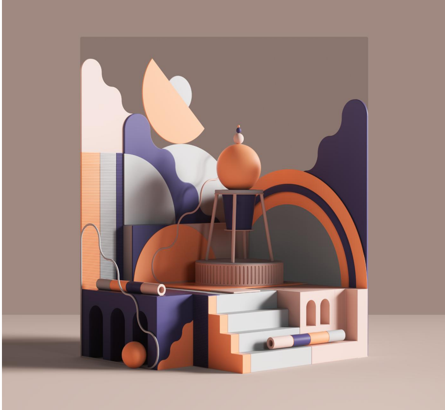
Summer by Peter Tarka

3D designers dream up new compositions and shapes over 2D work like drawing and painting.