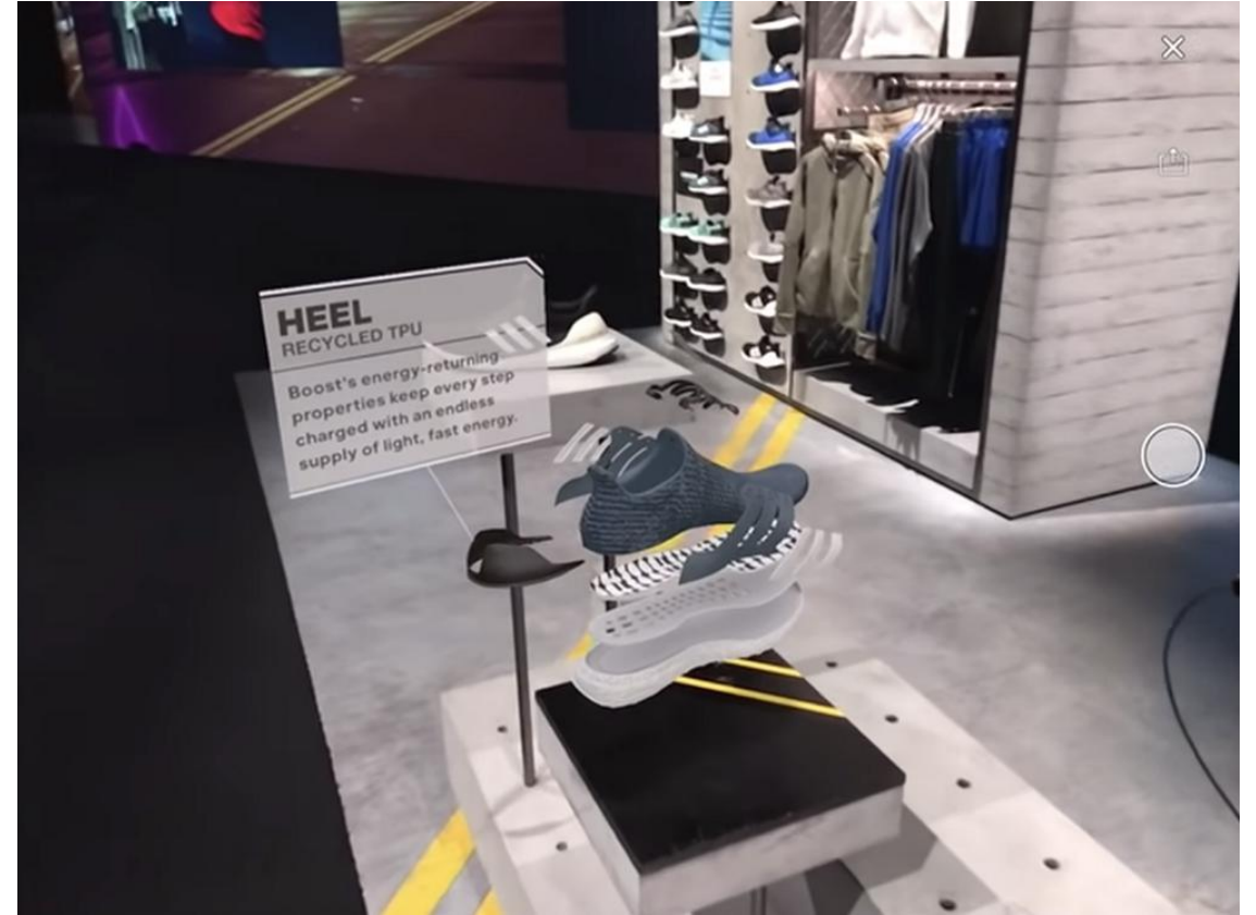
3D experience in retail

3D designers dream up new compositions and shapes over 2D work like drawing and painting.