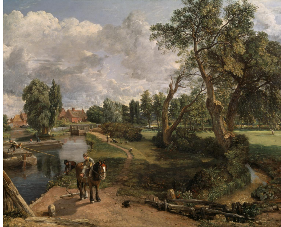
John Constable Flatford Mill (1816-7)